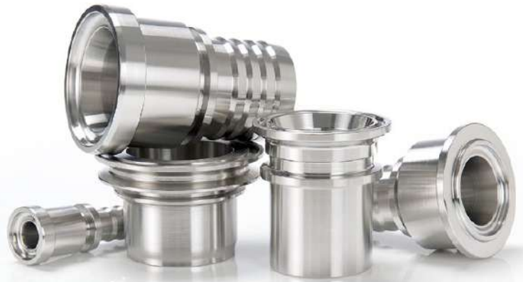
Crimping 'free of dead spaces / flared'

Crimped hose coupling with flush-mounted hose tail. No obstruction of inner cross-section, almost no gap or dead volume between lining and hose tail. For high purity requirements. Suitable for all coupling types.